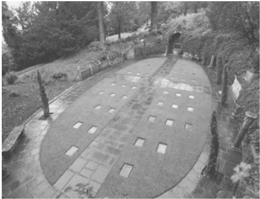
The Memorial Garden at Cliveden. The graves are managed by the Commonwealth Graves Commission

This talk tells the story of the War time hospitals, its patients, the involvement of the Astors, the local community, how the hospital eventually came under the wing of the National Health Service and what remains today.